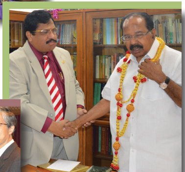
R. Shivakumar with Mr. M. Veerappa Moily Union Minister of Petroleum and Natural Gas, Govt. of India