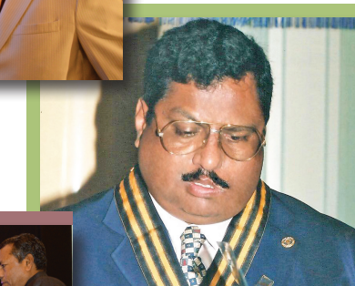
R. Shivakumar with Mr. K. H. Muniyappa Union Minister of State (Independent charge) of Minister of Micro, Small and Medium Enterprises, Govt. of India