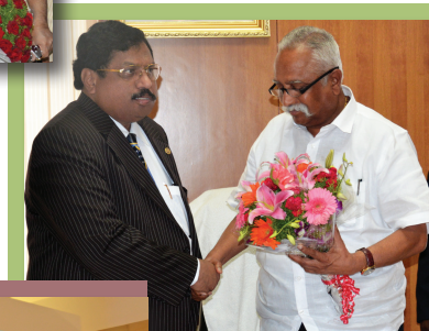
R. Shivakumar with Mr. Dinesh Gundu Rao Hon'ble Minister of State for Food and Civil Supplies